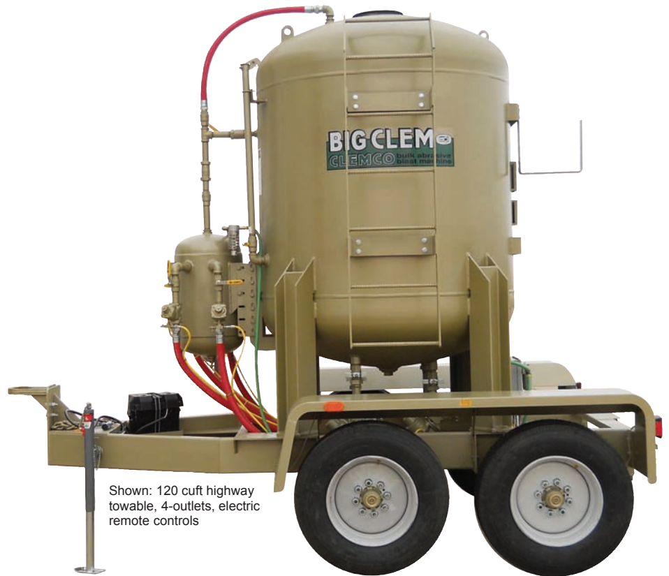
Shown: 120 cuft highway towable, 4-outlets, electric remote controls

Each operator station is fitted with Auto-Quantum (pneumatic or electric) pressure-hold remote controls, which allow each operator to start and stop independent of the others. The Quantum is an all-media valve, making it possible to switch between expendable mineral or slag abrasives to steel grit as necessary. Pneumatic remote controls are best when the blast hose is 100 feet or shorter; beyond 100 feet electric remotes are recommended to minimize the response time at the nozzle for beginning or stopping blasting.